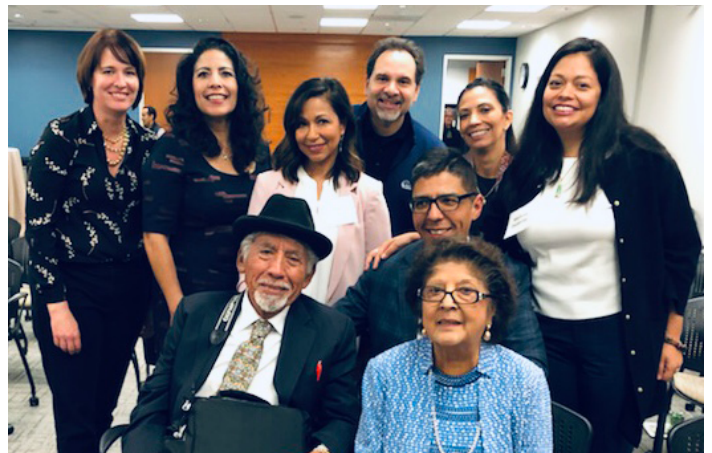
Castellano Trustees with SVCF staff and grantees at the Blueprint for Change launch event

Yet structural change is slow, challenges remain, and without access to greater and more sources of philanthropic support, Latinx nonprofits remain both under-resourced and overburdened.